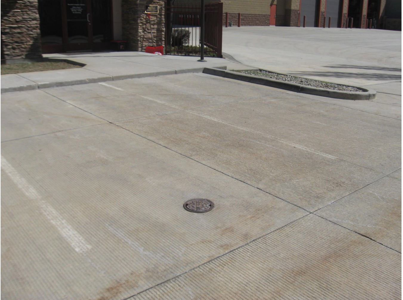
Groundwater monitoring well MW-2