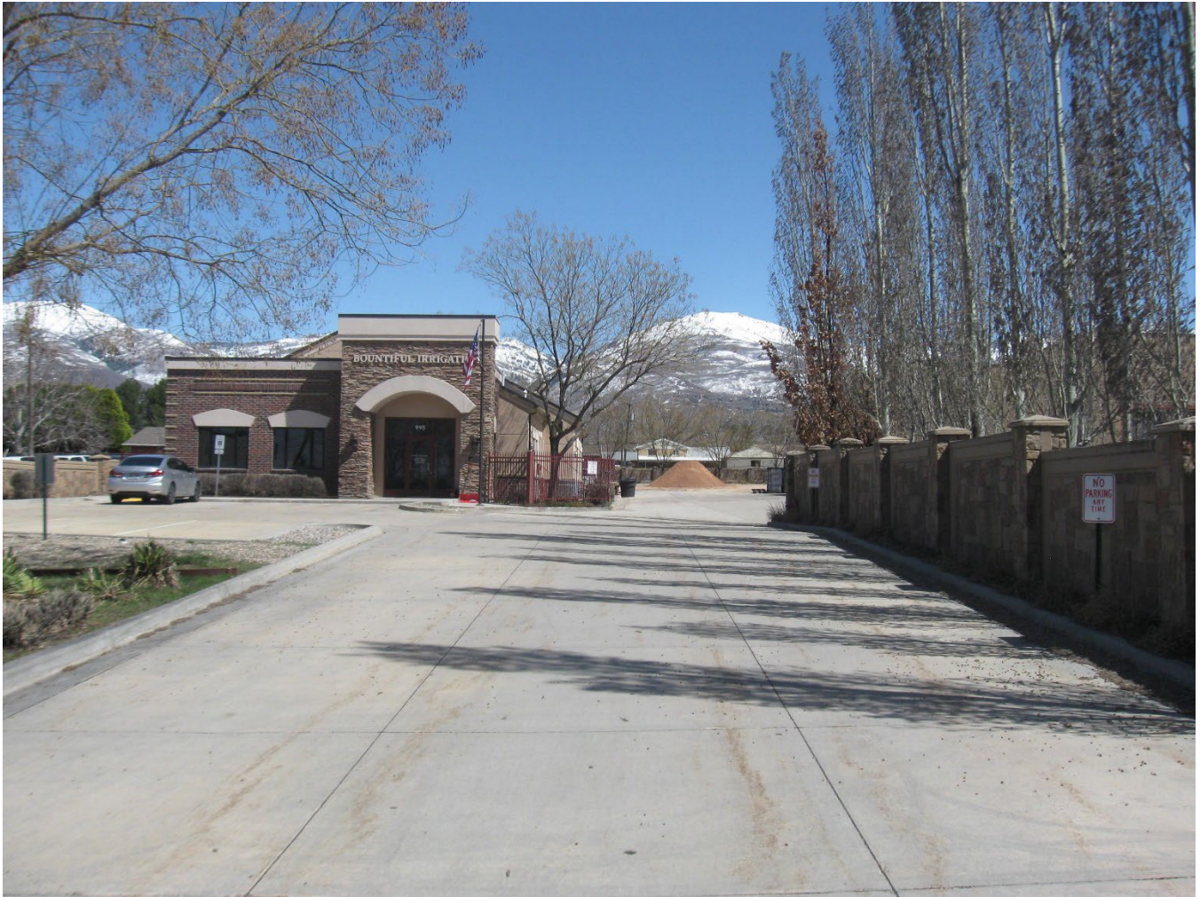
General view to the east of the Intermountain Waste Oil Refinery Site