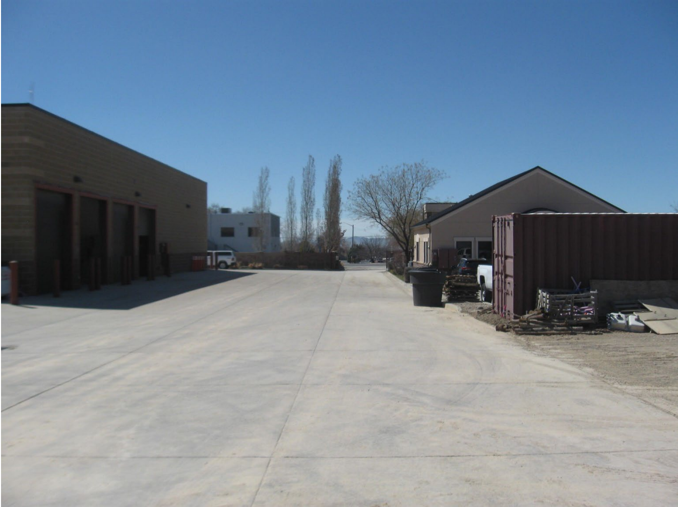
General view to the west of the Intermountain Waste Oil Refinery Site